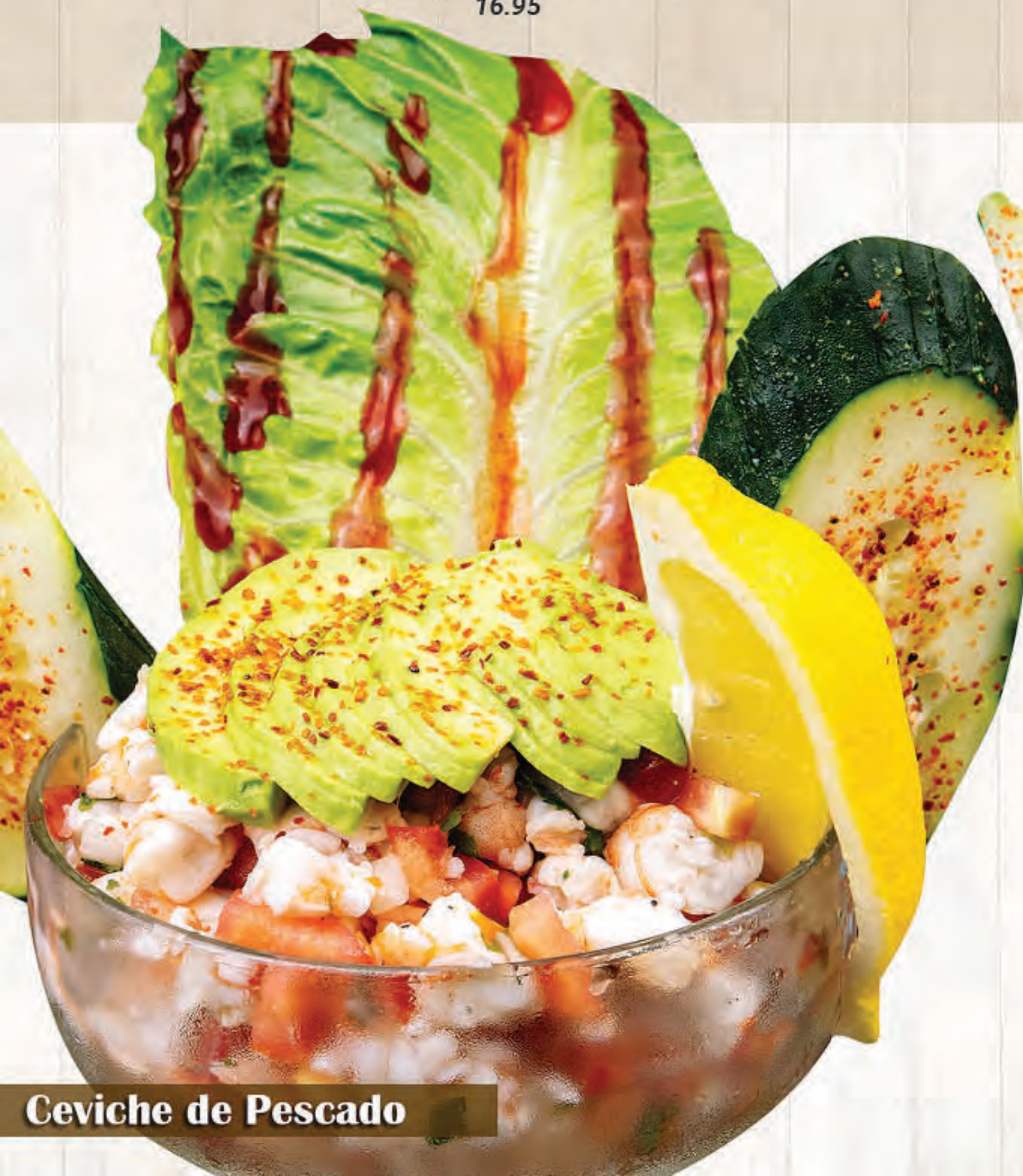
Ceviche de Pescado