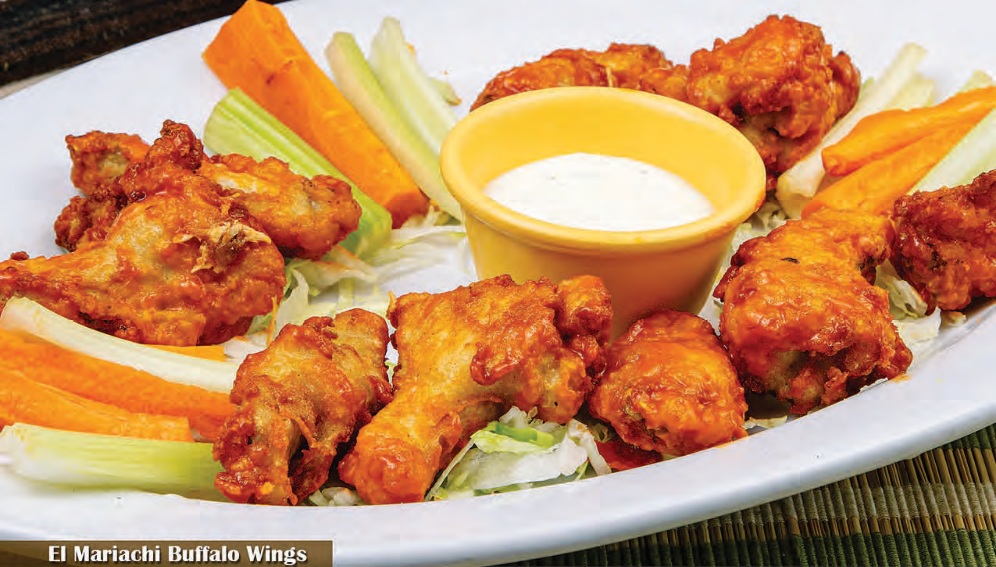
El Mariachi Buffalo Wings