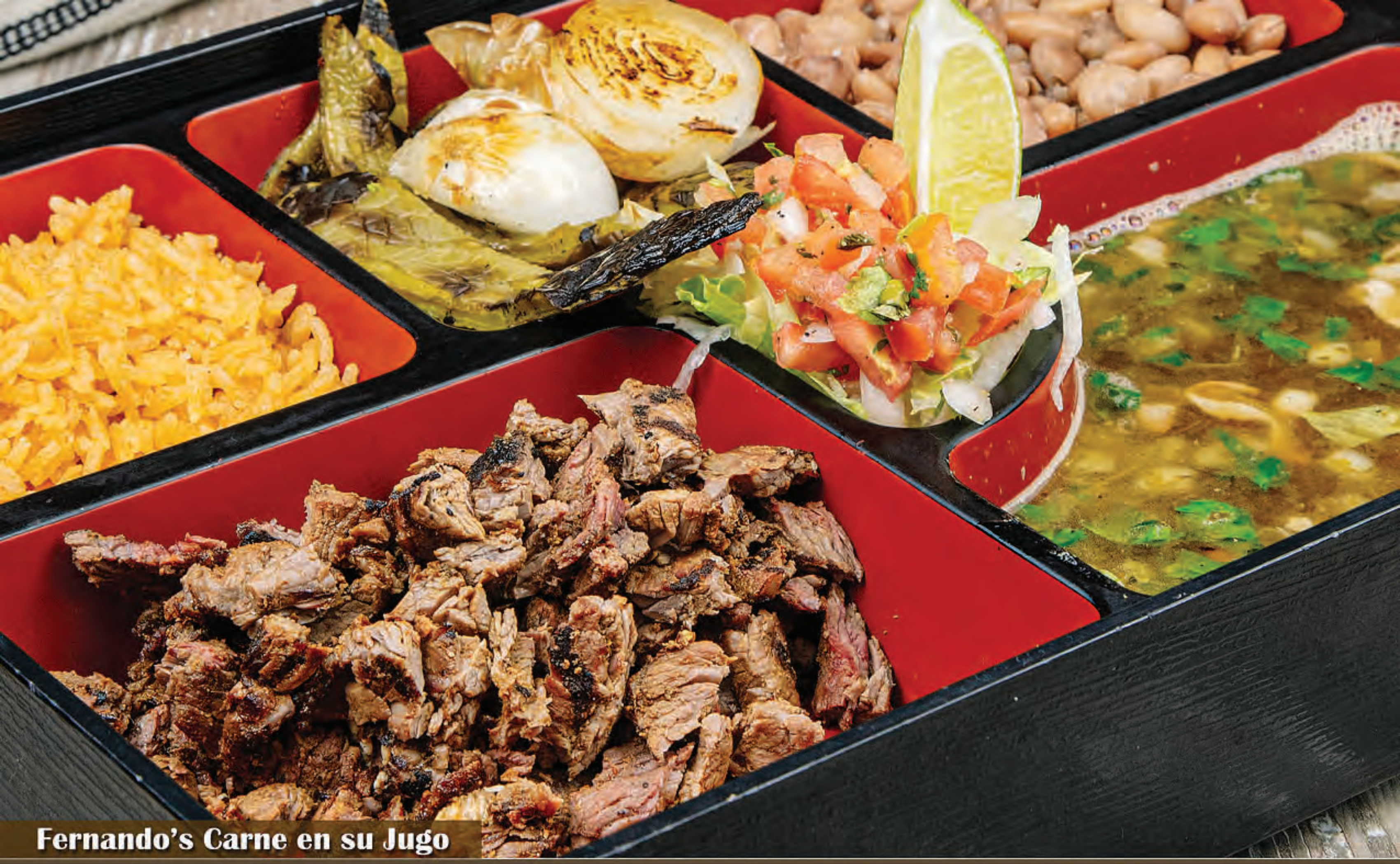
Fernando's Carne en su Jugo