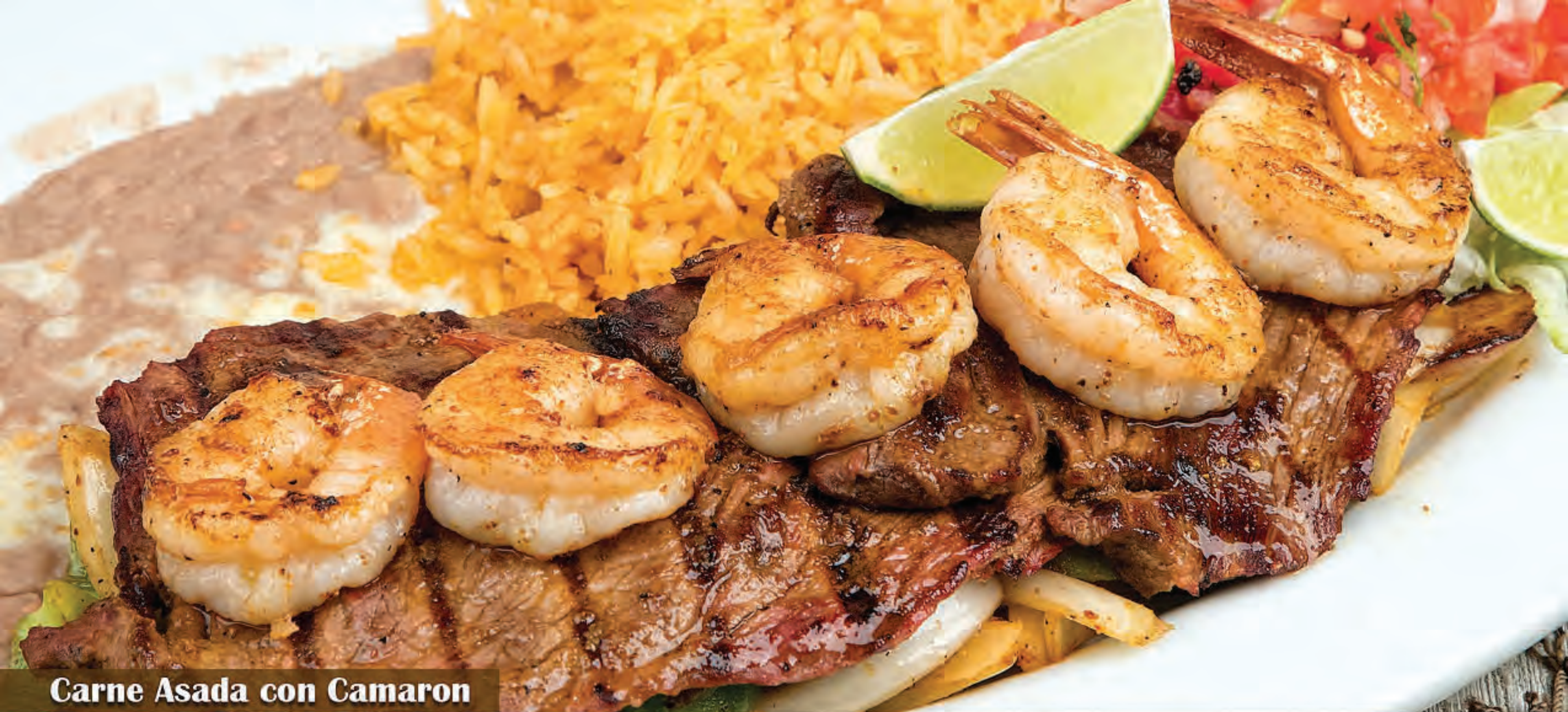
Carne Asada con Camaron