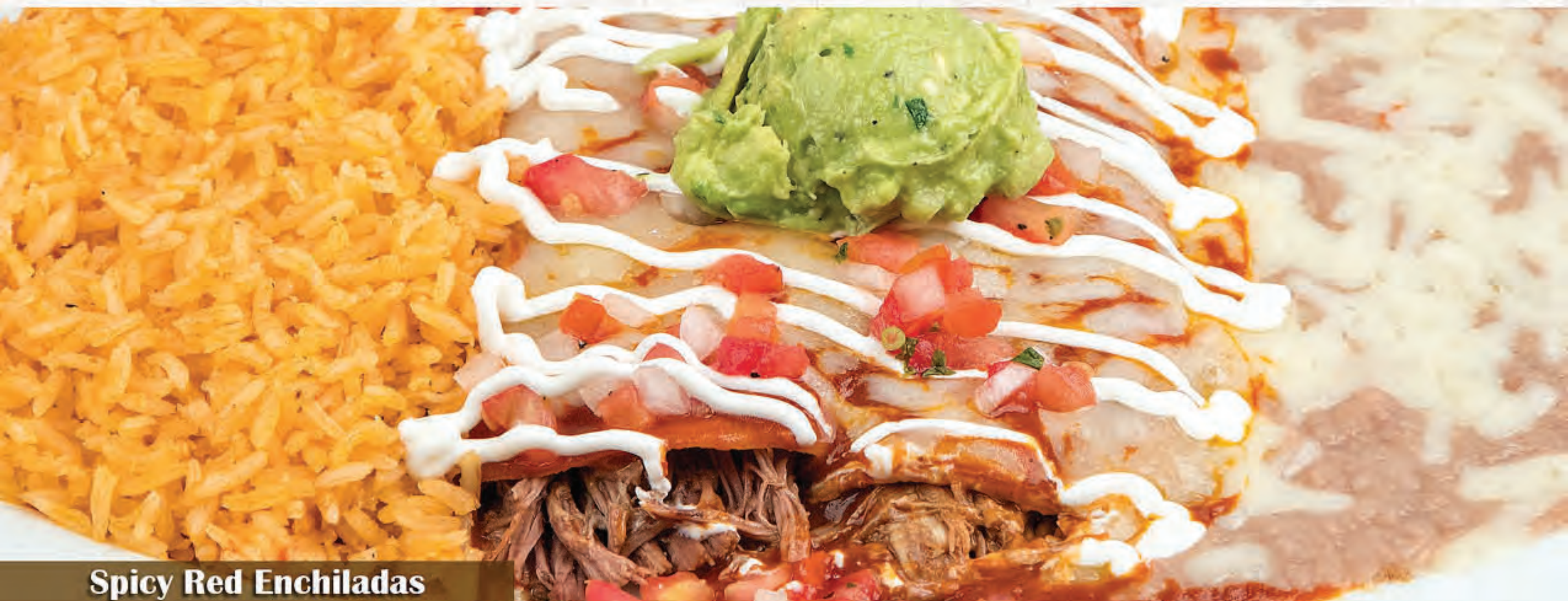
Spicy Red Enchiladas

Chicken, tomatillo, cream, white onions & cilantro. 15.95