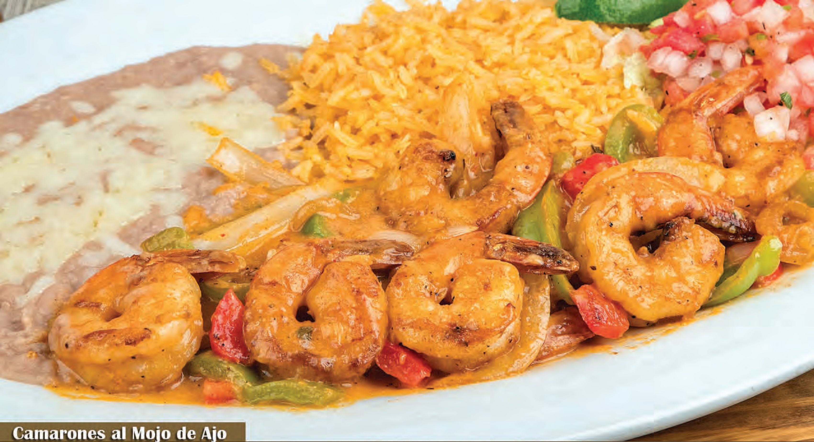
Camarones al Mojo de Ajo