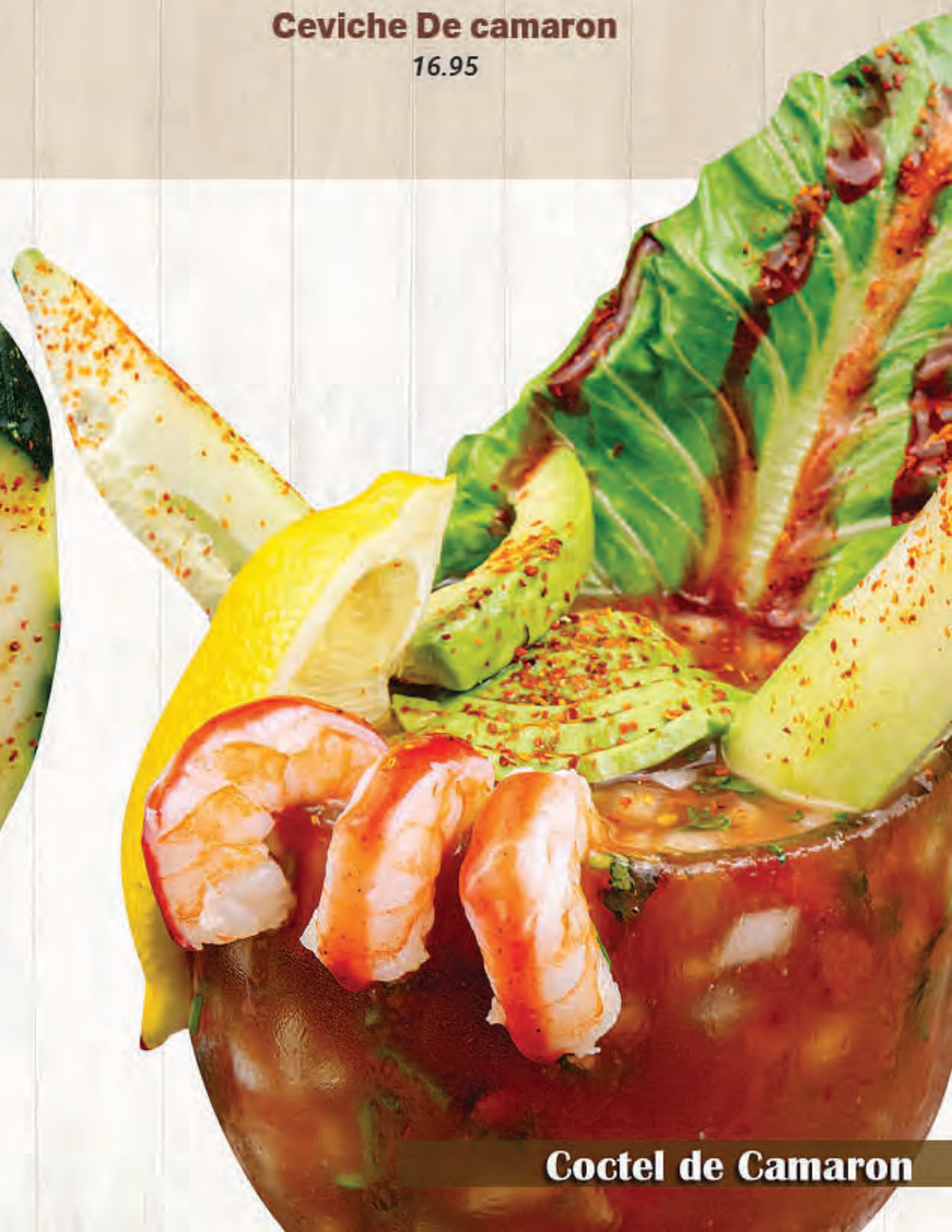
Coctel de Camaron